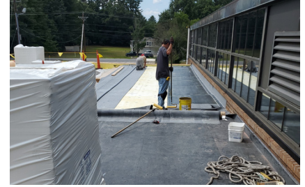
Above: New roof membrane at kitchen addition.

PHASE 7: DELIVERY OF NEW GYM, FINAL PHASE OF EXISTING CLASSROOM WING