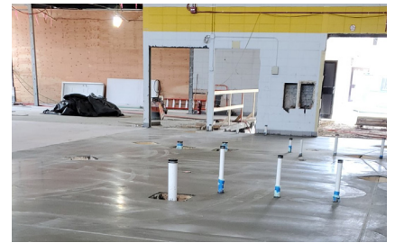
Above: Interior floor slab poured at new public toilet rooms at old gym.