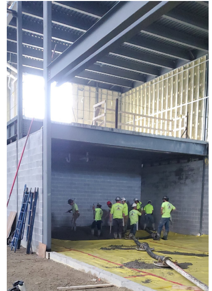
Above: Interior floor slab poured at stage in new gym.